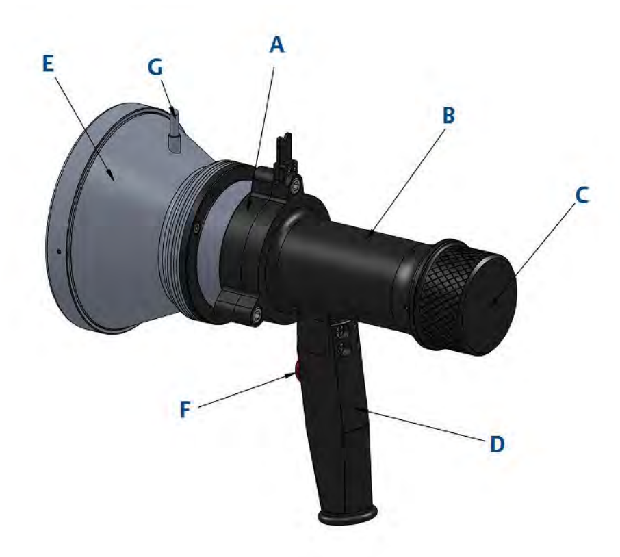
Figure 1-1: Flame simulator side view

The battery pack can be replaced easily by opening the back cover. This exchange must be done in a safe area, using only a Rosemount battery pack, P/N 00975-9000-0012.