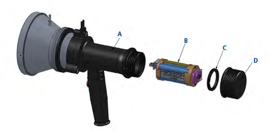
Figure 2-1: Flame Simulator battery replacement