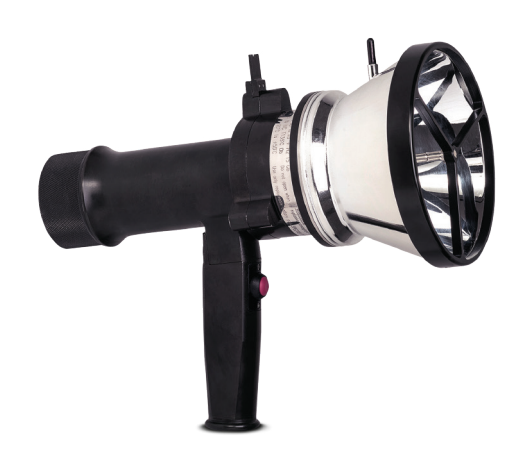
Rosemount<sup>™</sup> Flame Simulator

Therefore, by simulating a fire that actually triggers the detector outputs, the model FS-UVIR-975 verifies the correct operation of the Rosemount 975UF Ultra Fast Ultraviolet Infrared and 975UR Ultraviolet Infrared Flame detectors, performs an essential end-to-end loop test and verifies window cleanliness.