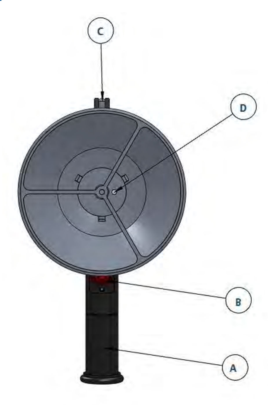
Figure 1-3: Flame simulator front view