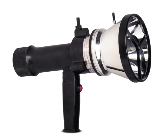
Rosemount<sup>™</sup> Flame Simulator

Therefore, by simulating a fire that actually triggers the detector outputs, the model FS-IR-975 verifies the correct operation of the 975MR detector, performs an essential end-to-end loop test and verifies window cleanliness.